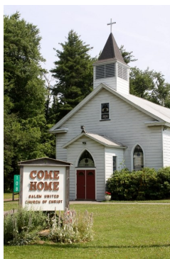
Church image on micro-cloth